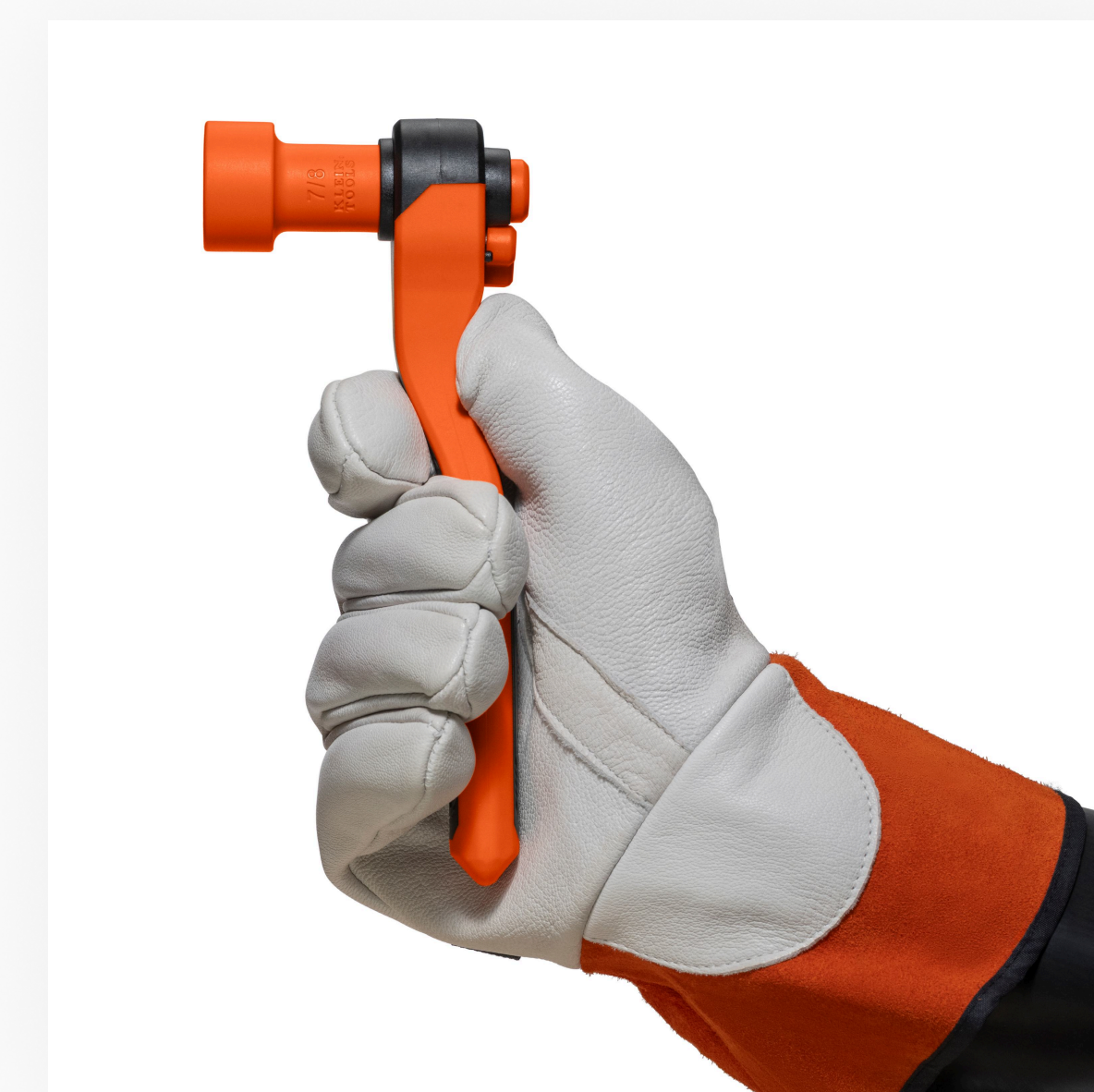
Engineered for Class 2 Gloves