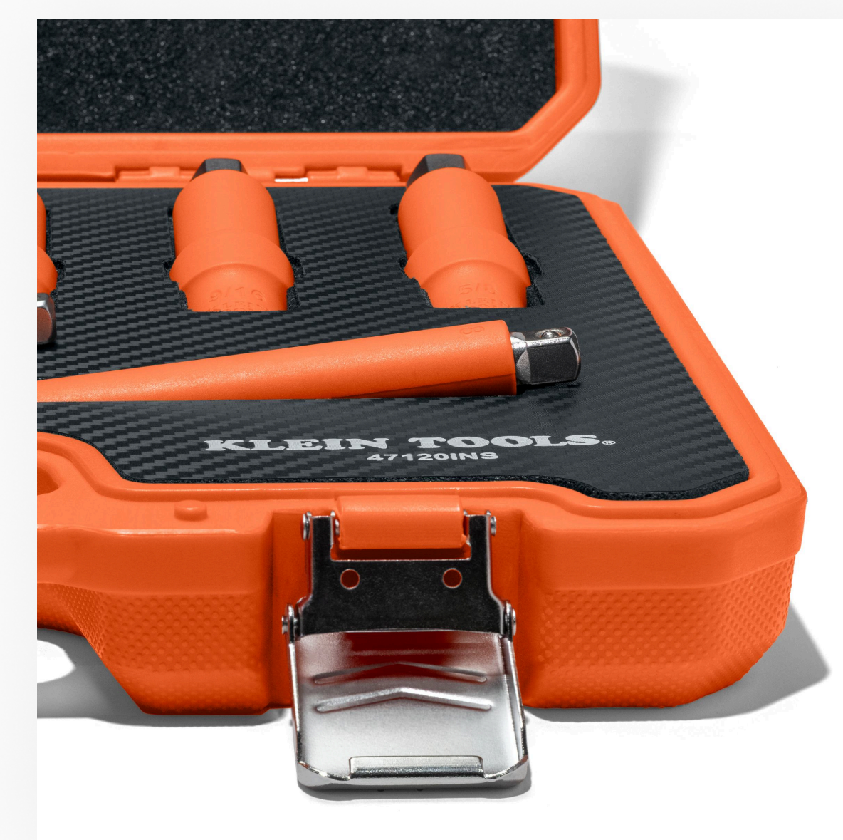
Stored in Offset Position Easy reach with class 2 gloves