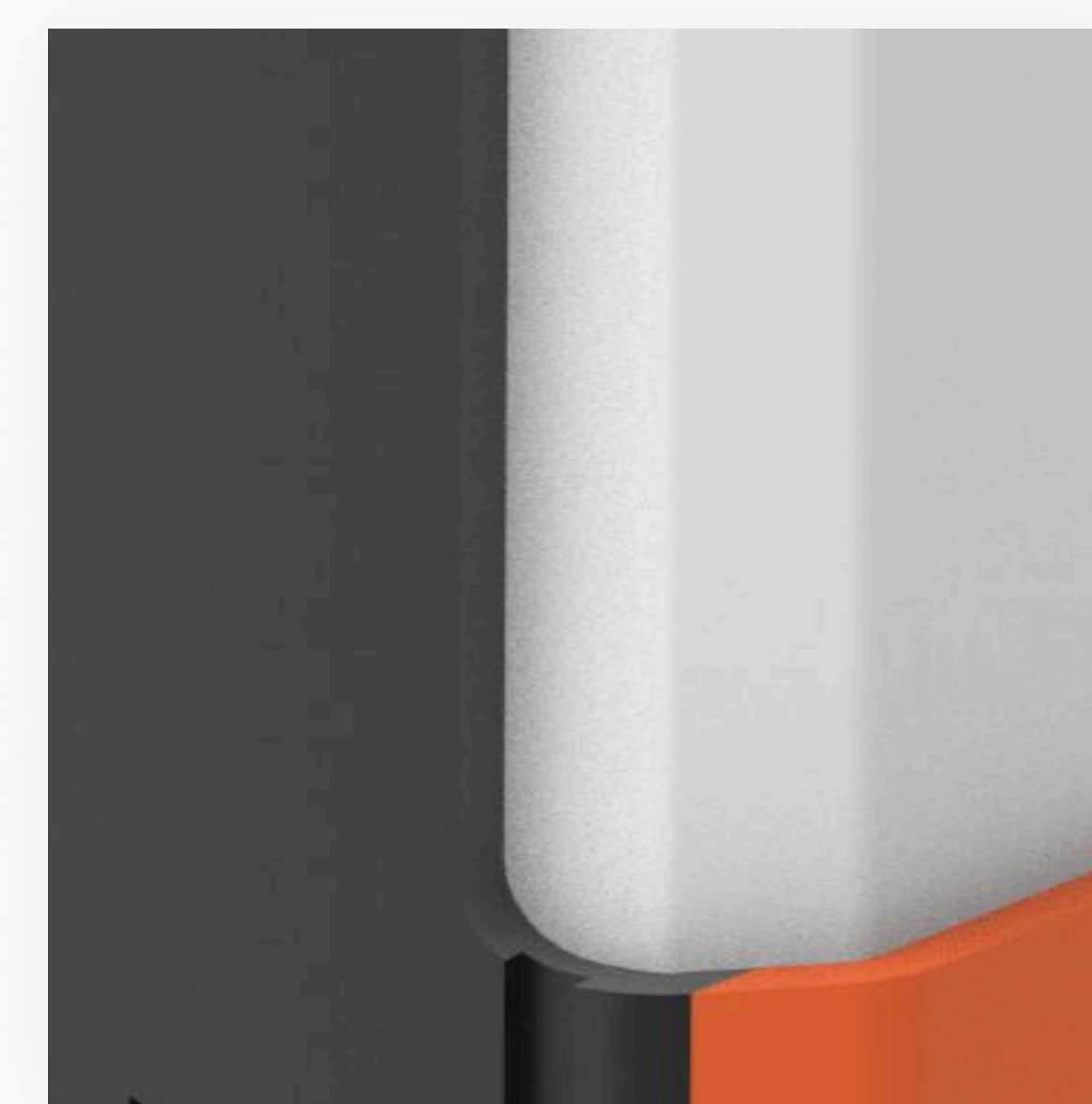
1000V Rated with Three-Part Insulation White wear indication layer